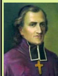
Founder – Bishop Charles de Forbin-Janson

(3) PONTIFICAL SOCIETY OF THE HOLY CHILDHOOD promotes missionary zeal among children so as to lead them to a sharing of spiritual and material resources with other children