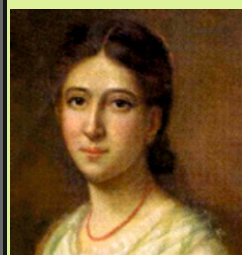
Founder – Venerable Pauline Marie Jaricot

The Pontifical Mission Organization (PMO) in India collaborates with the local Church to enhance passionate participation in achieving goals and objectives of the 4 Pontifical Mission Societies: